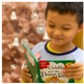
Skyler Chen (1H)