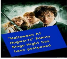
Bingo Night Postponed