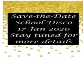
Disco Night 2020