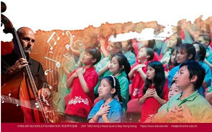
ENGLISH SCHOOLS FOUNDATION 英基學校協會 26/F, 1003 King's Road, Quarry Bay, Hong Kong https://www.esf.edu.hk info@esf.edu.hk

Date: THURSDAY, 04.04.2019 7PM QUEEN ELIZABETH STADIUM, WAN CHAI